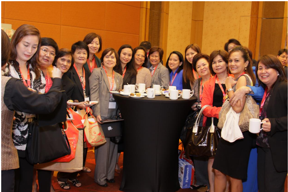
Overseas participants at the inaugural OGSS AFOG Regional Meeting 2012 held at Marina Bay Sands Expo & Conference Centre Singapore, 31 August – 1 September 2012