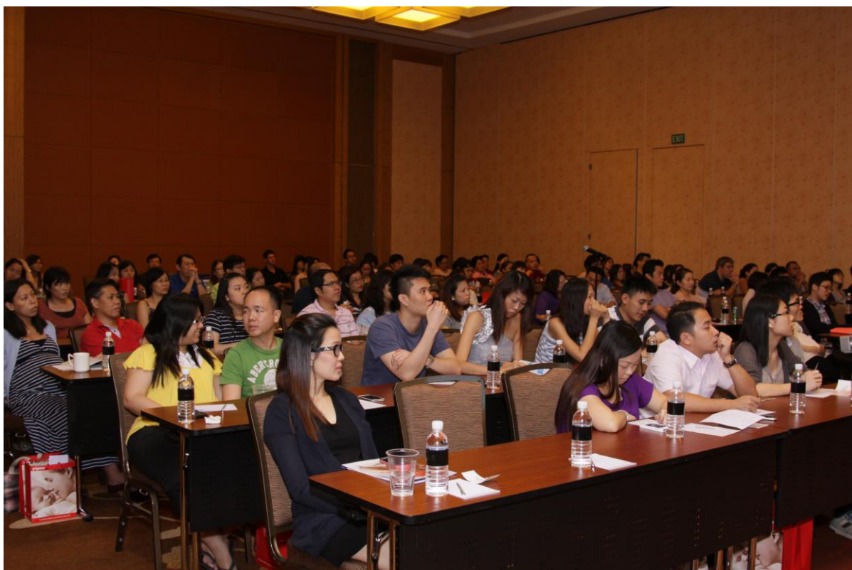
The Public Forum with the theme Victorious Living – Empowering Pregnancy, was well attended by members of the public