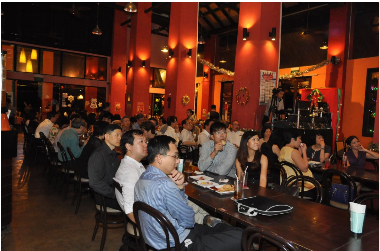
OGSS Members at Tawandang Microbrewery, Dempsey Road on OGSS Education Night, 13 December 2012