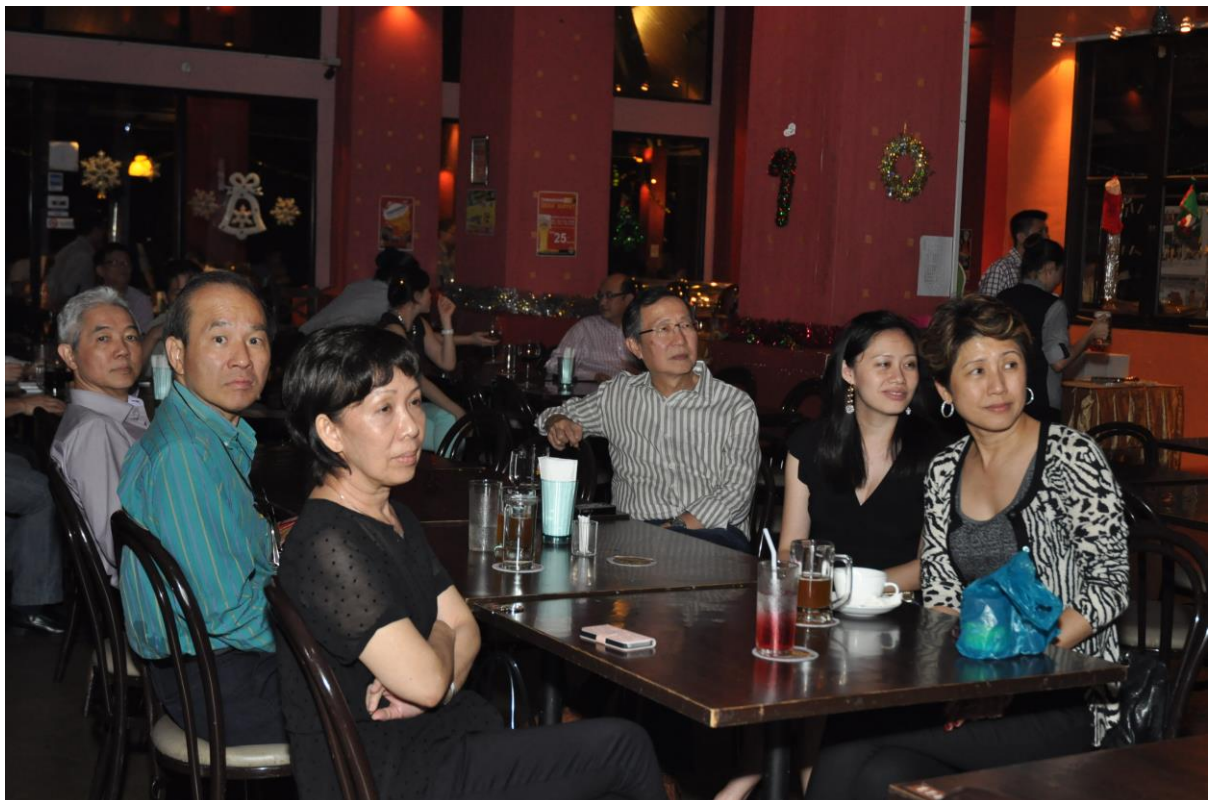
OGSS Members at Tawandang Microbrewery, Dempsey Road on OGSS Education Night, 13 December 2012