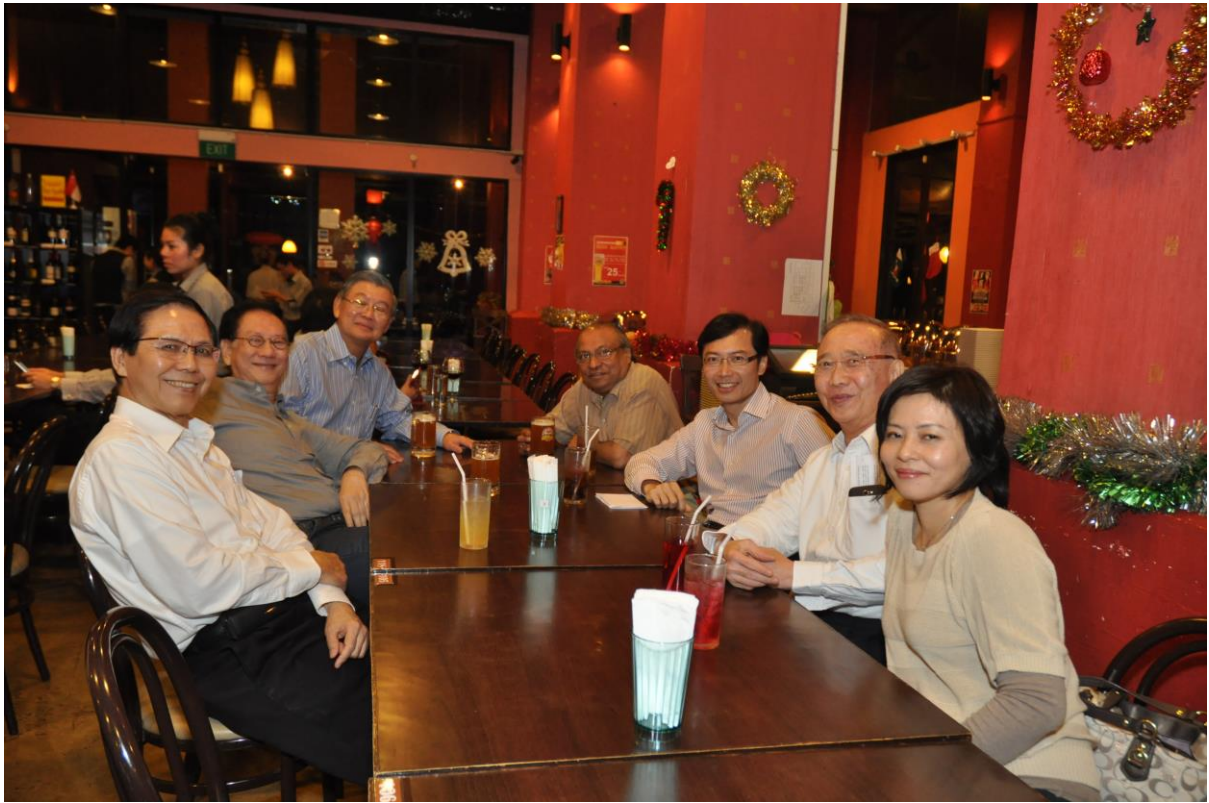
OGSS Members at Tawandang Microbrewery, Dempsey Road on OGSS Education Night, 13 December 2012