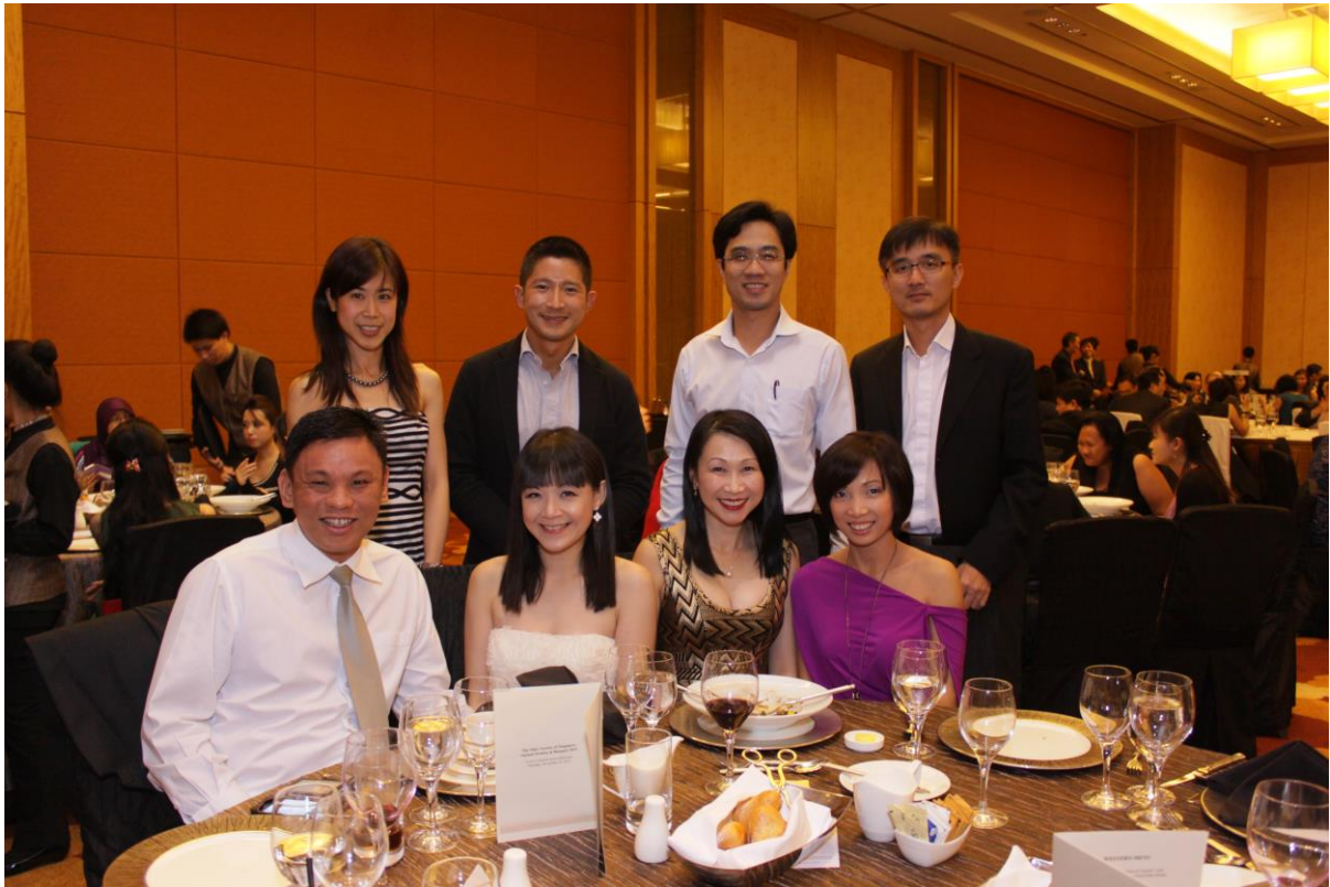
Members and guests at the Annual Oratorion & Banquet at Marina Bay Sands, 22 November 2012