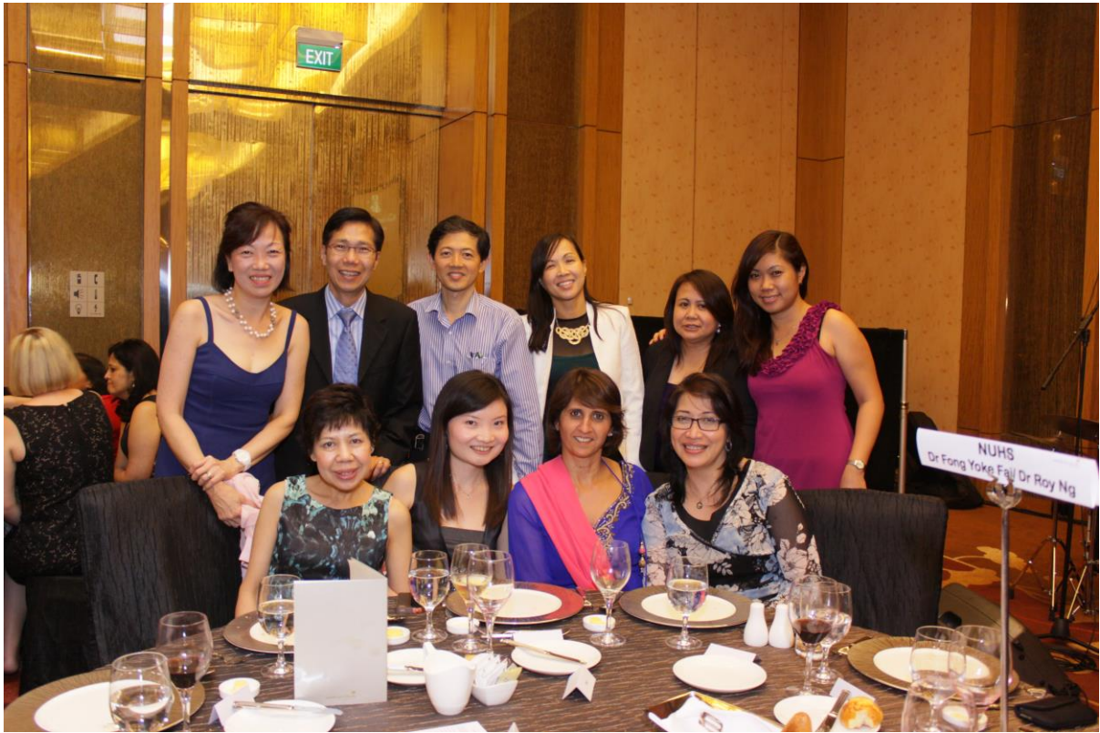
Members and guests at the Annual Oration & Banquet at Marina Bay Sands, 22 November 2012