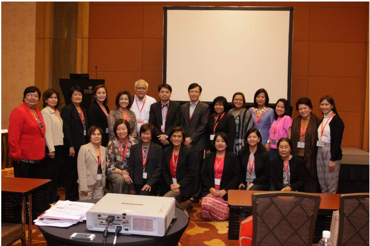
Speakers and overseas participants at the inaugural OGSS AFOG Regional Meeting 2012 held at Marina Bay Sands Expo & Conference Centre Singapore, 31 August – 1 September 2012